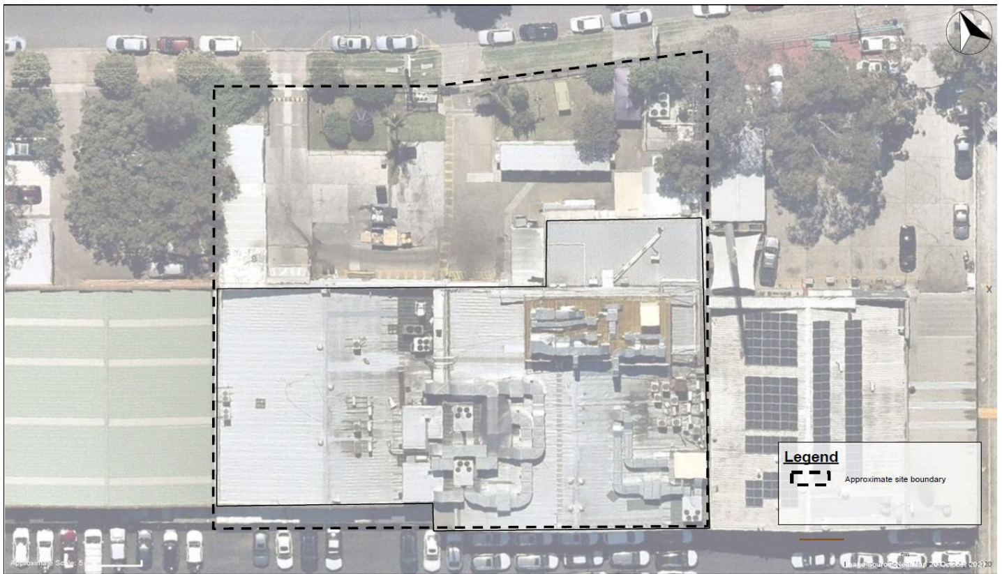
Figure 1.1 - Site Location – 9 Amax Ave