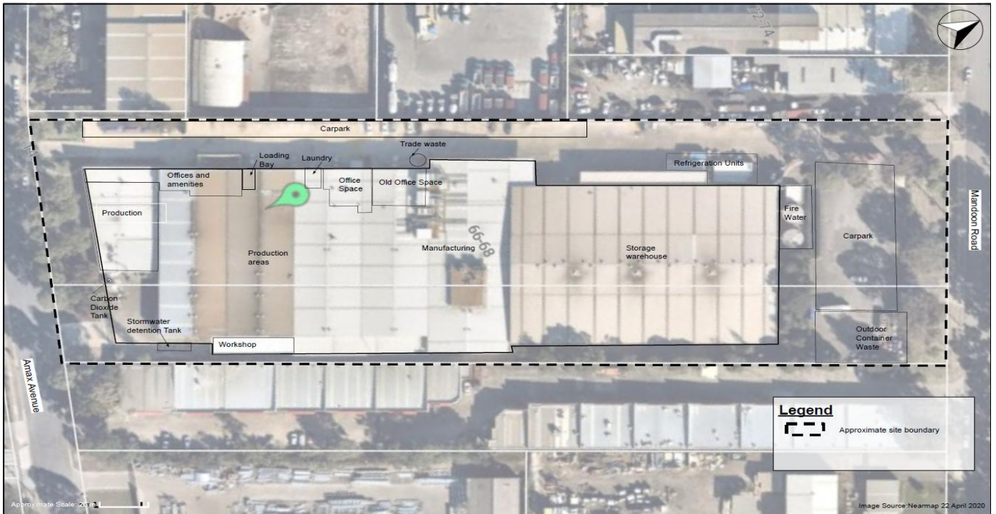
Figure 1 - Site Location – 14 Amax Av